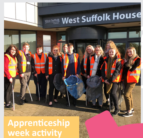
Apprenticeship week activity