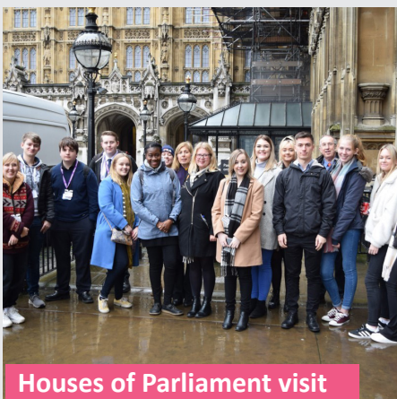
Houses of Parliament visit