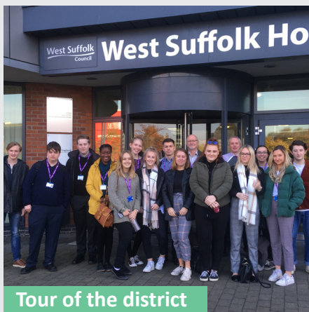
Tour of the district